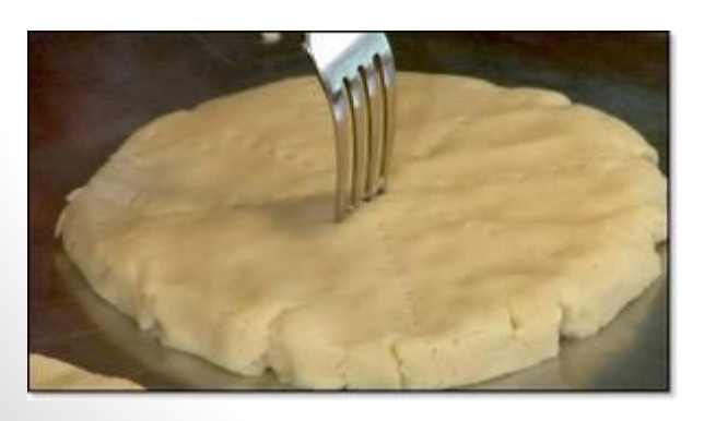
Biscuits made by the rubbing in mixture are usually rolled and cut into shapes