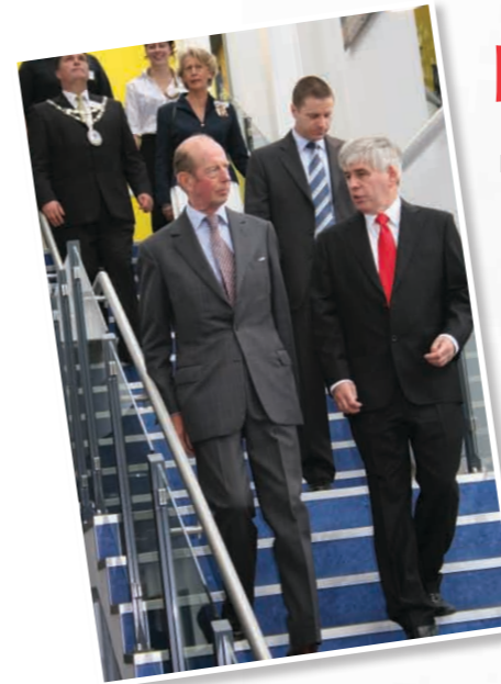
Royal visit: HRH The Duke of Kent opened the new Science building.

This has now become a double celebration, with the announcement that Prince Henry's is also the first high school in the whole country to receive the Global School Award at Level 3, another accolade, which recognises our commitment to developing an international ethos throughout the school.