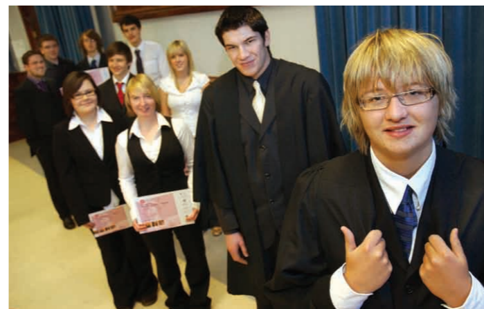
Court appearance: Year 12 students visited Leeds Crown Court.