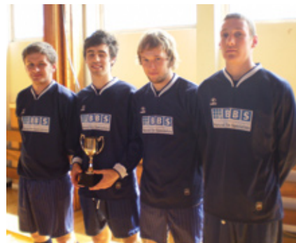
Team players: The First XI football team.