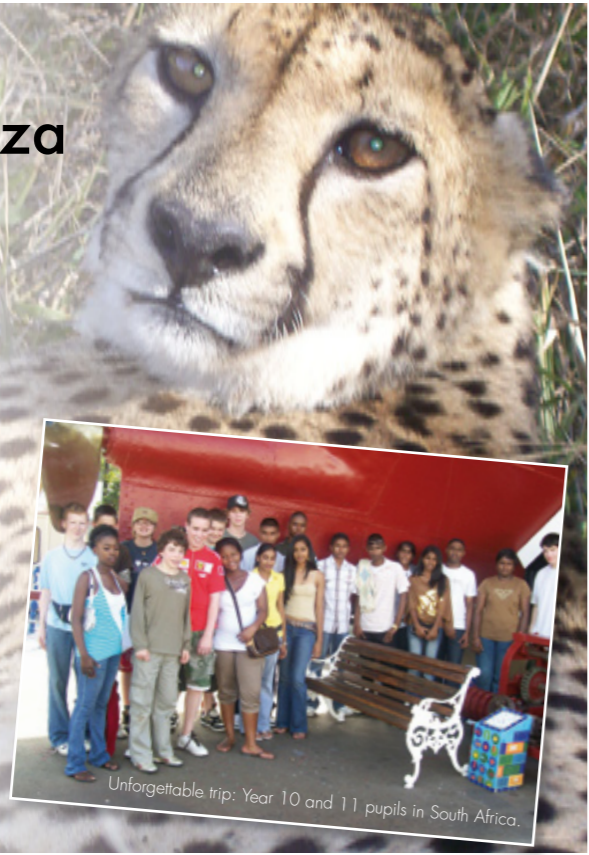
Unforgettable trip: Year 10 and 11 pupils in South Africa.

Closer to home, pupils taking GCSE and A-level Music courses took part in African drumming workshops. They learned to play African percussion instruments, coached by Alison Lyon, an experienced drummer and African music enthusiast. The experience gave students a valuable insight into African music.