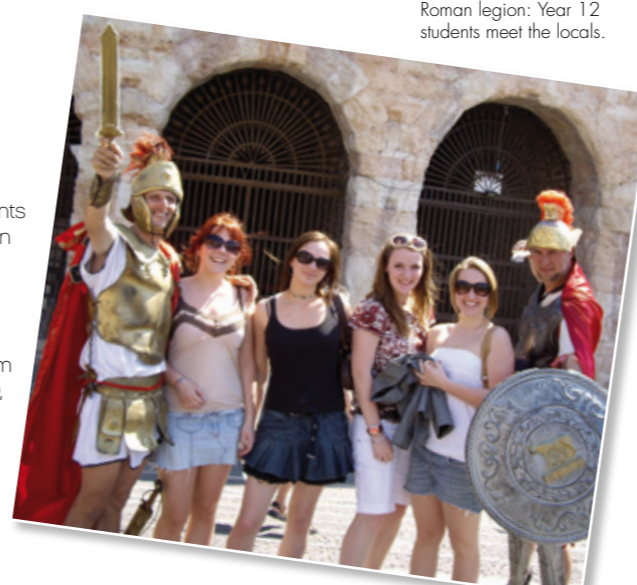
Roman legion: Year 12 students meet the locals.