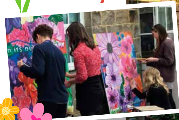
Bright and beautiful: The mural in situ and Year 12 students at work on the pieces.