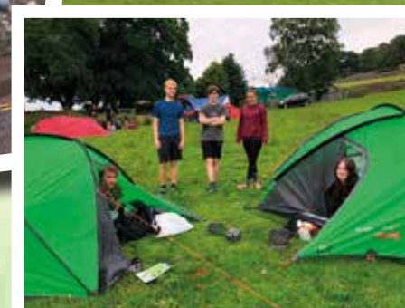
Expedition success: Gold (left) and Silver Award students on their expeditions.