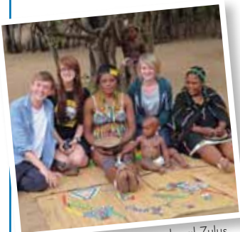
Village fete: Students meet local Zulus.